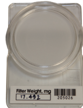
47 mm Filter Pre-weighted MW-47