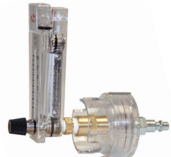
Total Particulate Test Module LP-47PF