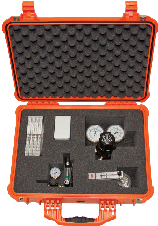
Air Quality Test Kit LP/HPA445K

Air Systems' breathing air quality test kits are designed to test the air produced by both low pressure compressors (use model LP-A4) and high pressure air in cylinders (use model HP-A4 or HP-A445). The tests are accomplished through the use of low cost detector tubes providing a "go/no go" test of the air quality. If a high reading is found, this signals potentially unacceptable breathing air quality and a laboratory analysis of the breathing air must be made to determine the exact readings of the air quality in order to take corrective action.