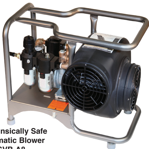
8" Intrinsically Safe Pneumatic Blower SVB-A8