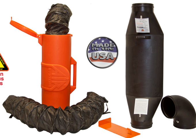
8" Conductive Ventilation Kit SV-CUPCND