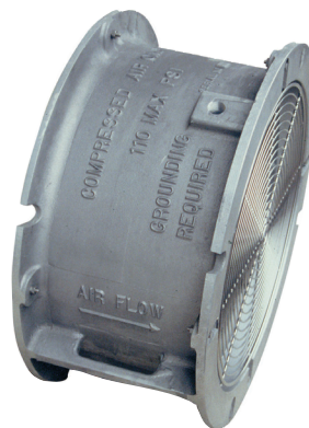
Pneumatic Jet Fan ASI-JF24