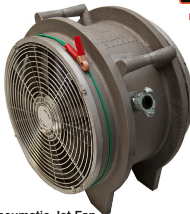
Pneumatic Jet Fan ASI-JF16