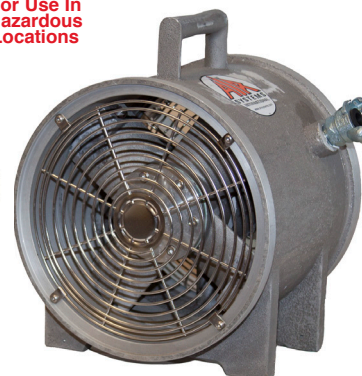
Pneumatic Jet Fan ASI-JF12