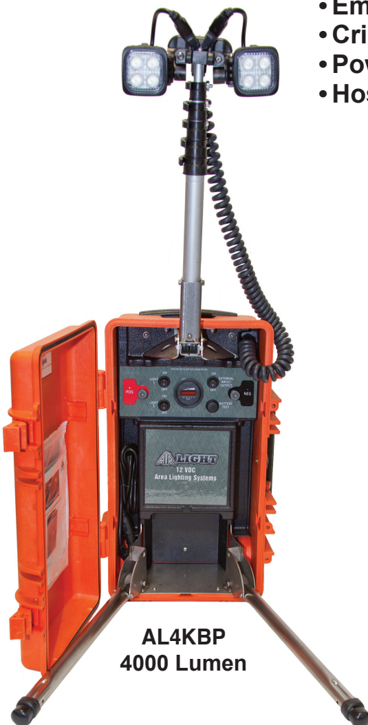
AL4KBP 4000 Lumen