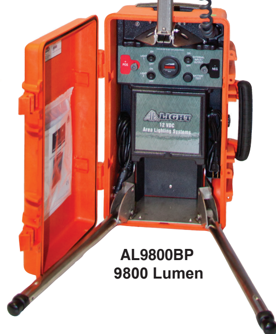
AL9800BP 9800 Lumen