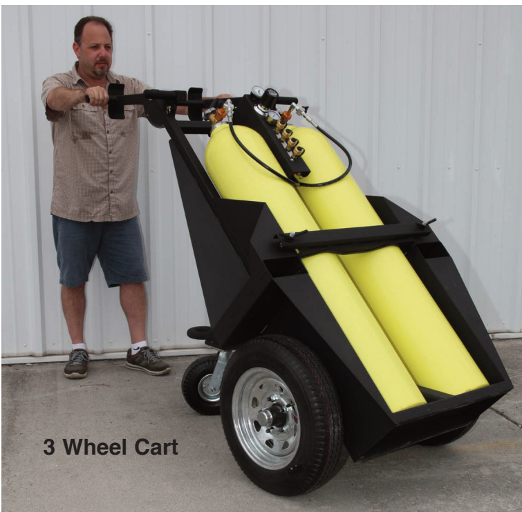
3 Wheel Cart