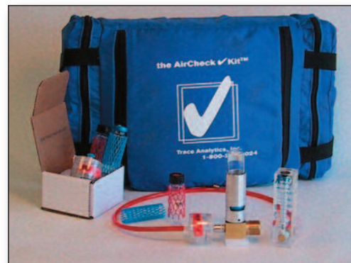
ACK-97 & AQT-1LS