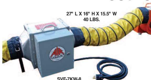
27" L X 16" H X 15.5" W 40 LBS.