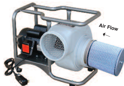
Blower sold separately