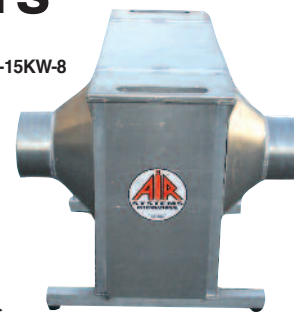
32" L X 27" H X 37.5" W 95 LBS.