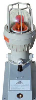
Explosion-Proof Remote Alarm 50-EXALPST

Custom modifications available to meet the most demanding customer requirements. Contact our technical sales department for additional details. Engineering drawings and specifications will be provided for your application.