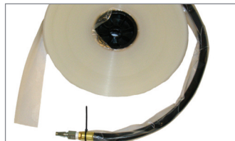
LF2H - Polyethylene Hose Cover