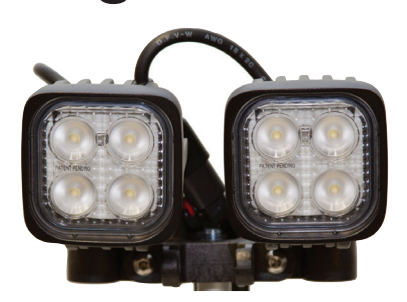
4000 total lumens 2 amps, 24 watts