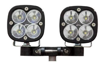
9800 total lumens 6.65 amps, 80 watts