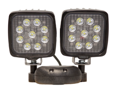
9500 total lumens 7.5 amps, 90 watts