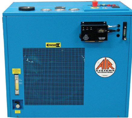
Horizontal Fill Compressor