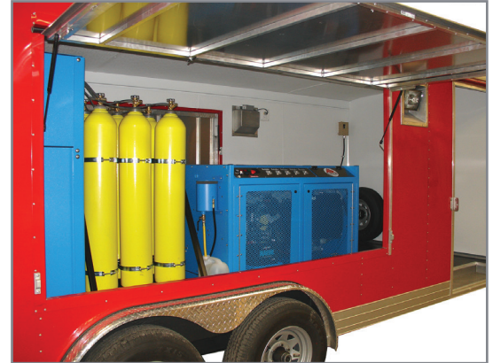
Mobile Fill Trailer

Electric, Gasoline, or Diesel Models Available