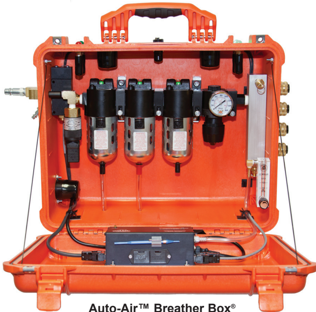
Auto-Air™ Breather Box® Electronic Reserve Air System BB50-COAA

Specify 1/4” Hansen style or Schrader style respirator fittings when ordering. Other fittings available for an additional charge.