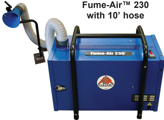
Fume-Air™ 230 with 10' hose