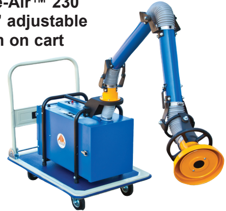
Fume-Air™ 230 with 5' adjustable arm on cart

Air Systems' portable HEPA filtered fume extractor (PFE-230), provides 230 cfm flow through a 2.5" x 10' hose and a 5" hood with magnetic base stand. Ideal for small welding and soldering applications, such as spot or bench top welding, where large cabinet style fume extractors are not practical. The PFE-230 features a removable slag tray, spark screen, 2 pleated pre-filters, and a final HEPA filter (99.97% at 0.3 micron).