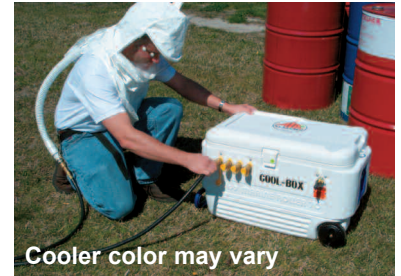
Cooler color may vary

Recommendation: Air Systems' Cool-Box™, provides approximately 70°F output air temperature at the end of 25 feet of air line hose with input temperatures up to 180°F. Designed and engineered for less than 2 psi pressure drop in the system with flow capacities to 75 cfm.