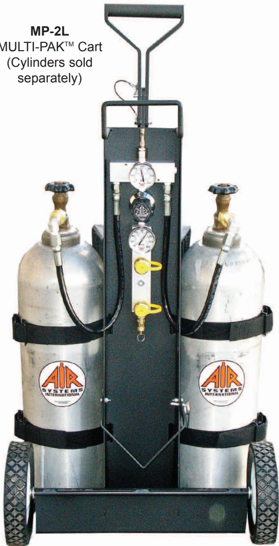
MP-2L MULTI-PAK™ Cart (Cylinders sold separately)

Recommendation: The MULTI-PAK™ series of small cylinder carts come in a variety of configurations, accepting 2216 psi or 4500 psi cylinders. The carts are compact, light weight, have a collapsible lifting handle, solid axle with semi pneumatic tires and recessed plumbing. MULTI-PAK™ carts accept all manufacturer's pressure demand respirators and are considered NIOSH point of attachment compliant. Two and four worker versions are available.