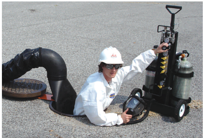
MULTI-PAK™ Portable Air Cart used with a confined space ventilation kit.