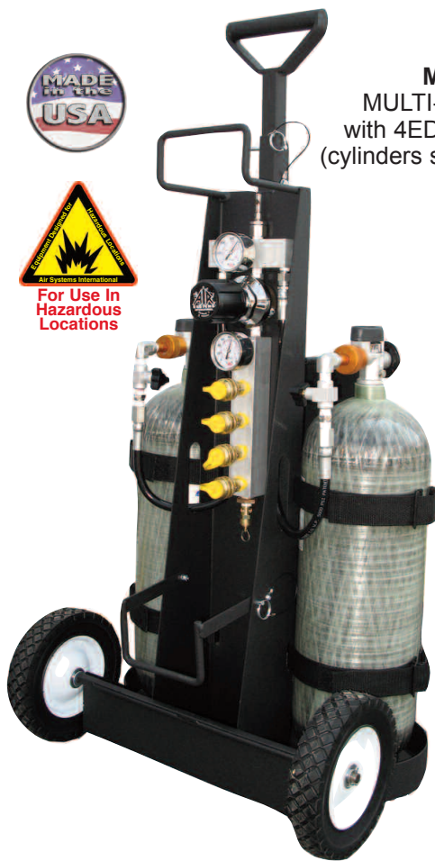
MP-4H MULTI-PAK™ Cart with 4EDZ6 Cylinders (cylinders sold separately)