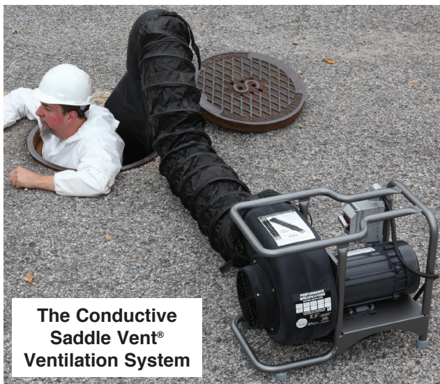
The Conductive Saddle Vent® Ventilation System