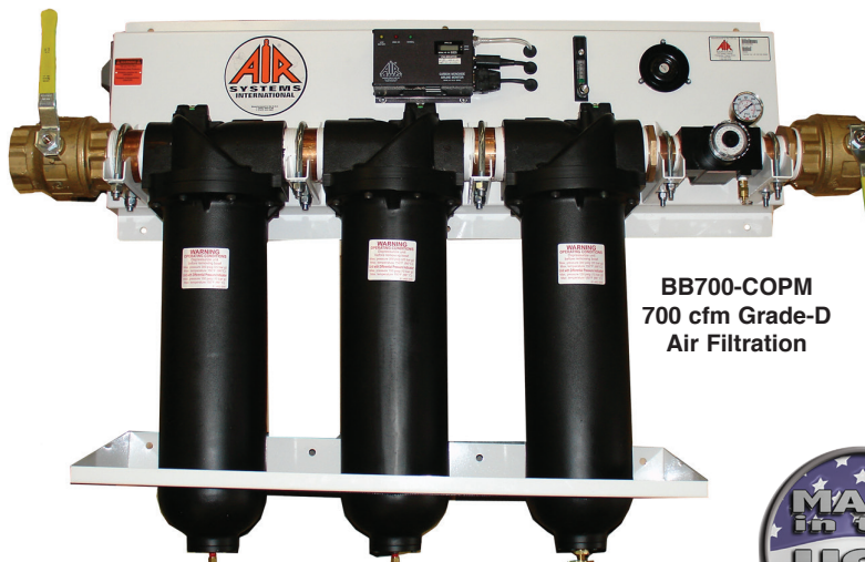
BB700-COPM 700 cfm Grade-D Air Filtration

Plant Filtration Systems Available Up To 3000 cfm