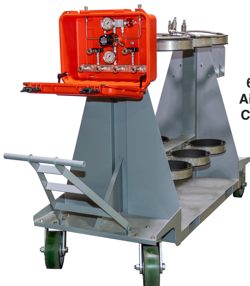
6 Cylinder Air Cart with Control Box

Call Customer Service for Additional Details