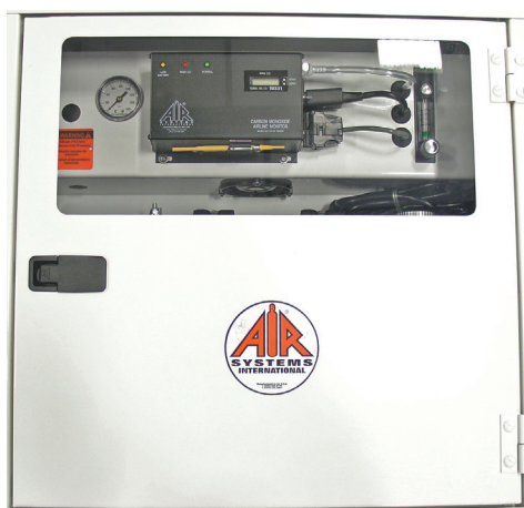
Grade-D Filtration for Clean Room Applications

Fully enclosed breathing air trailer with fill compressor, air storage cylinders, and fill containment station