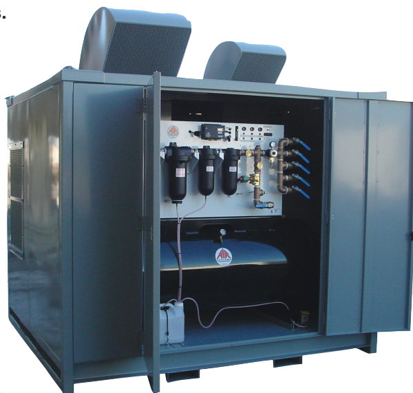
Custom Plant Breathing Air System