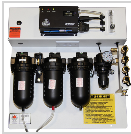
BB100-COPM 100 cfm Steel Panel 123 cfm flow capacity 4 couplings