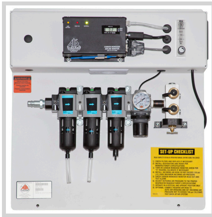
BB30-COPM 30 cfm Steel Panel 48 cfm flow capacity 2 couplings