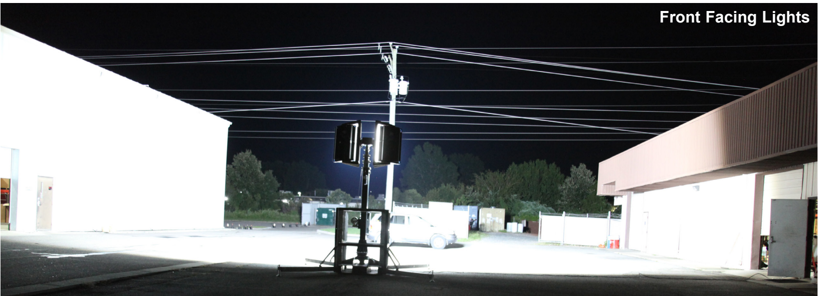
Front Facing Lights

Custom Options Available! Call Customer Service to discuss the perfect light for your application.