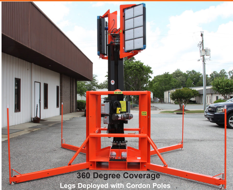
360 Degree Coverage Legs Deployed with Cordon Poles