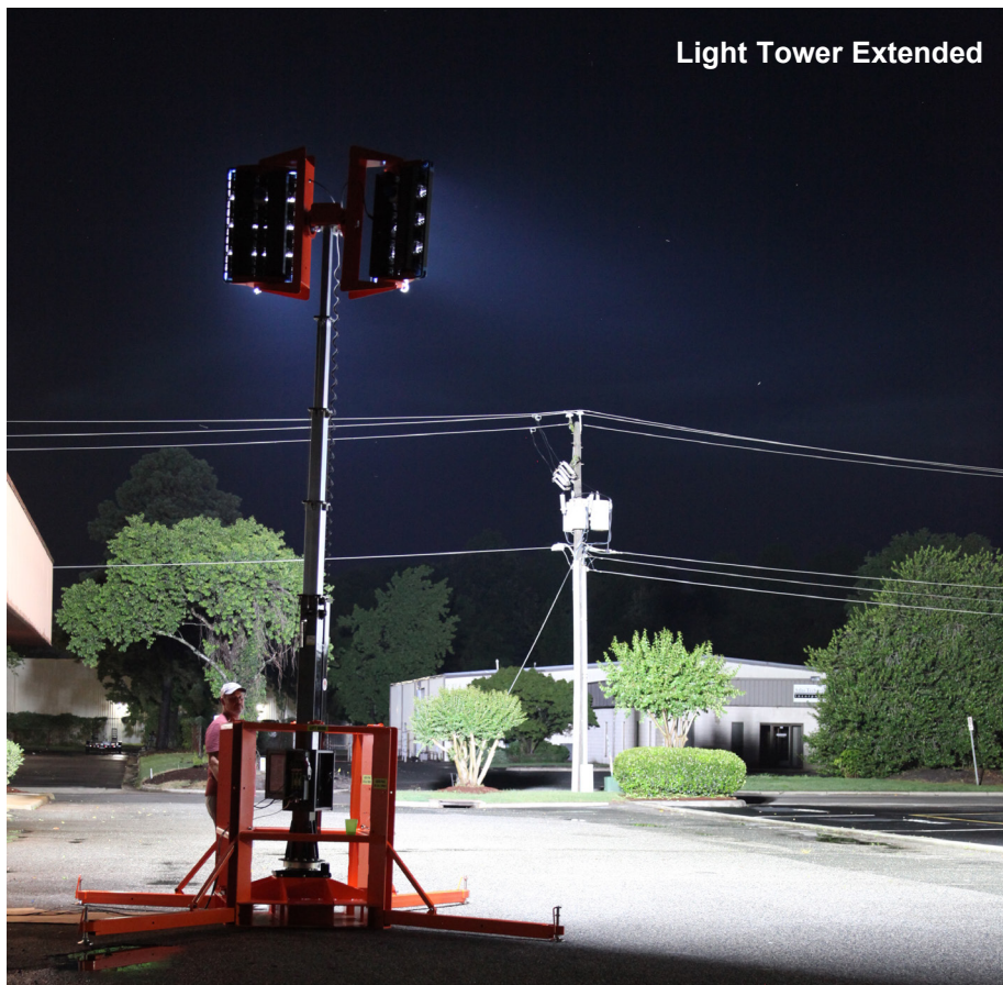
Light Tower Extended

Specify Voltage When Ordering Custom Colors Available Contact Customer Service For Details