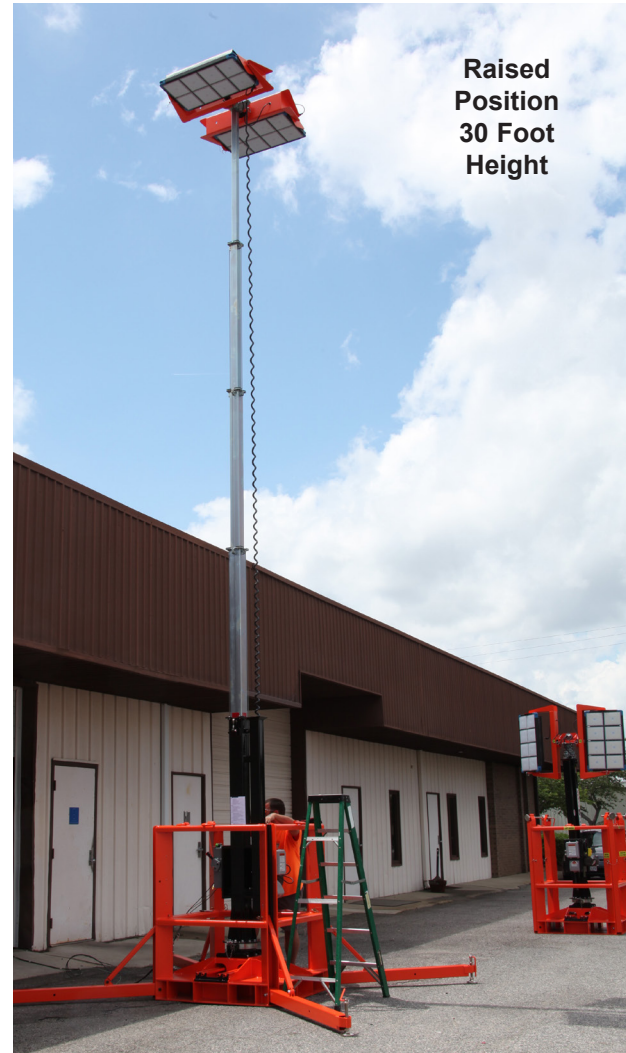
Raised Position 30 Foot Height