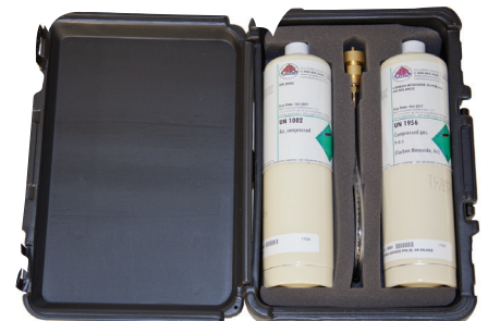
BBK-20 CO Calibration Kit