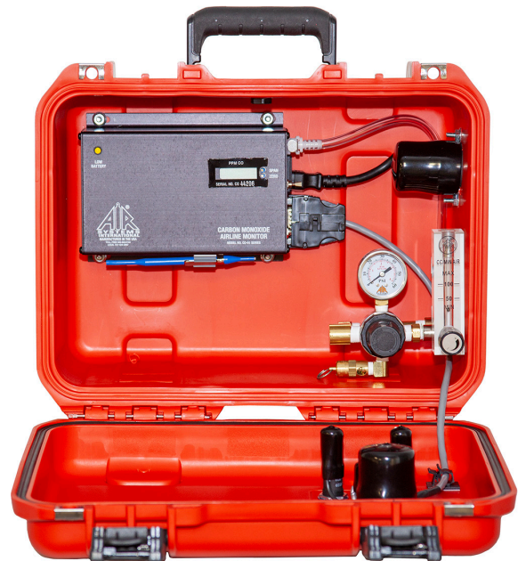
CO91-14LAC Portable CO Monitor